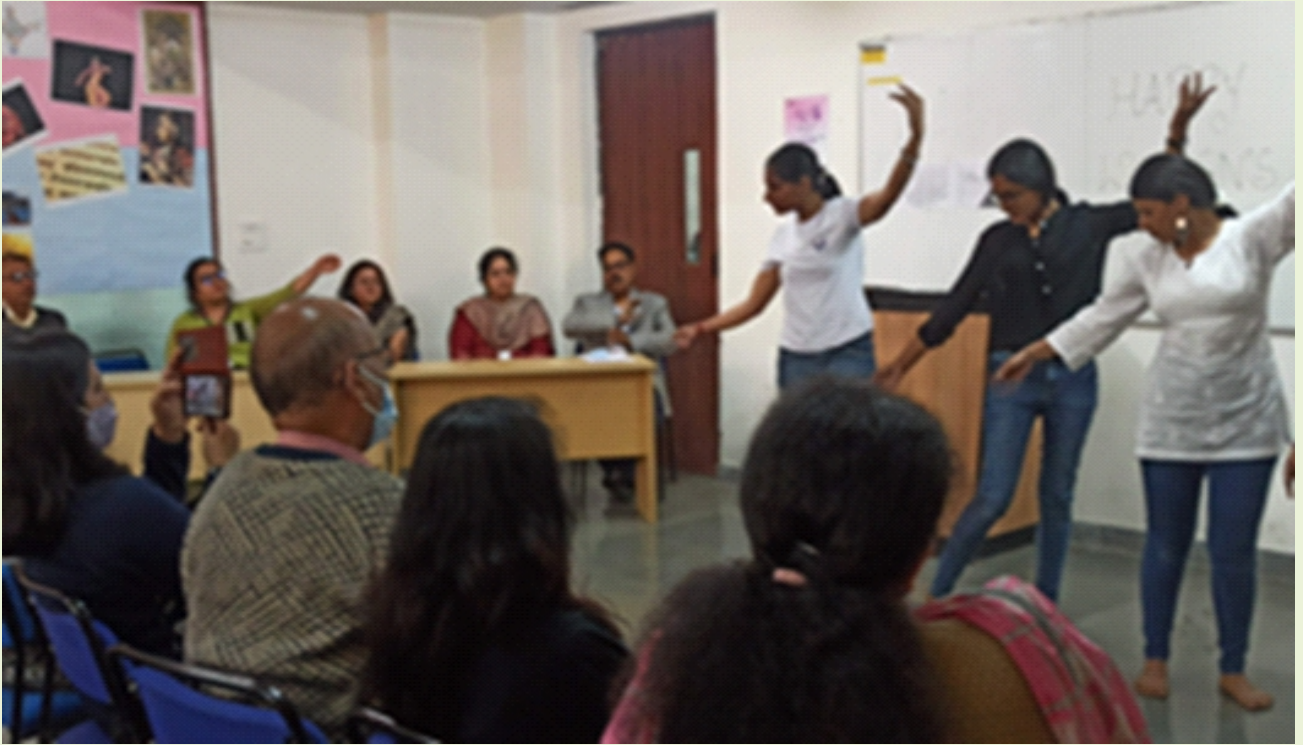
Students giving the performance on Gender Equality