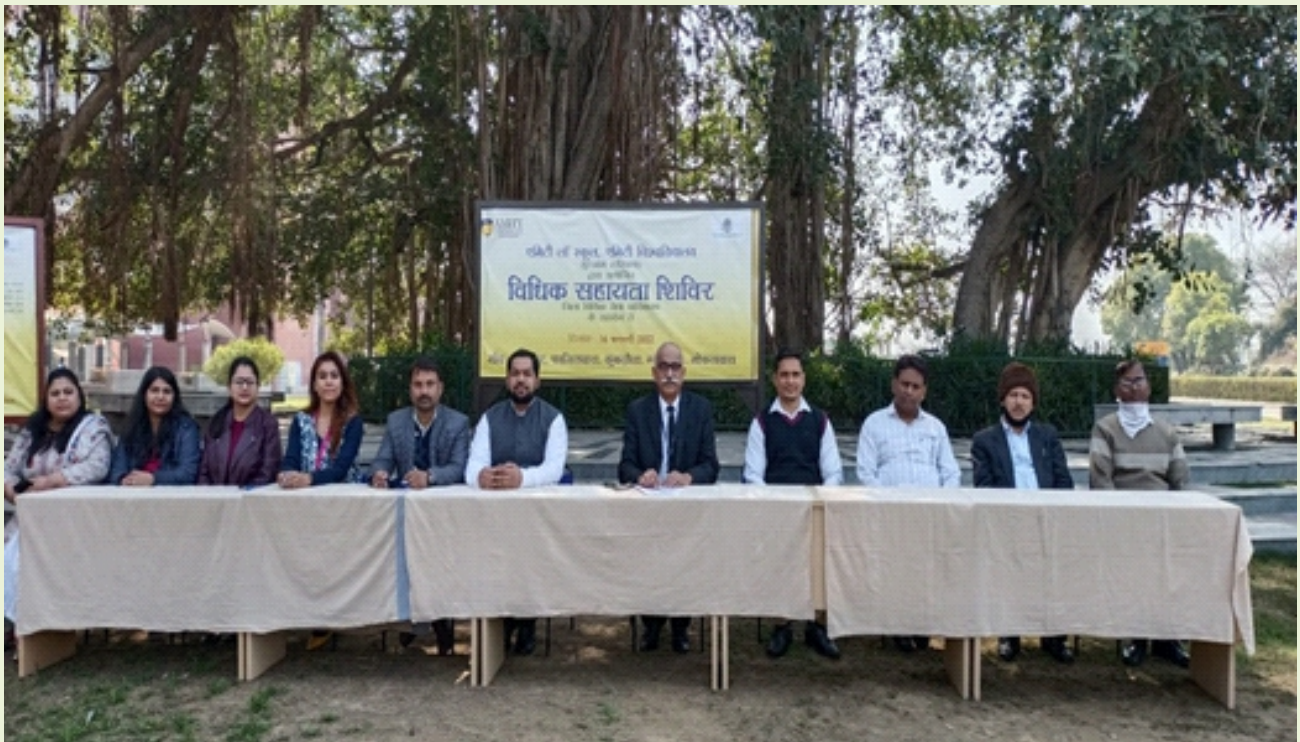
Esteemed professors and legal panel to aware the villagers regarding laws of children and women.

The Workshop “laws of women, children etc” was conducted on 16-feb-2022 by amity law school. the aim of creating awareness among villagers on the topics like Gender Discrimination, Domestic Violence, and Protection of Children from Sexual Offences, Female Feticide, Dowry Prohibition, Cruelty and Sexual Harassment at workplace.