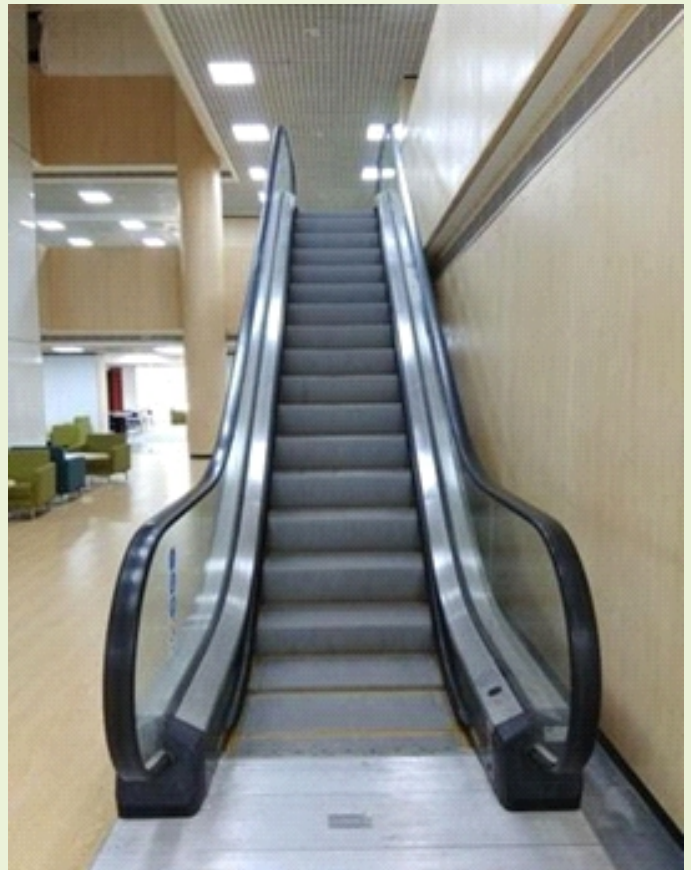
Fig: Provision of Lift and Elevators