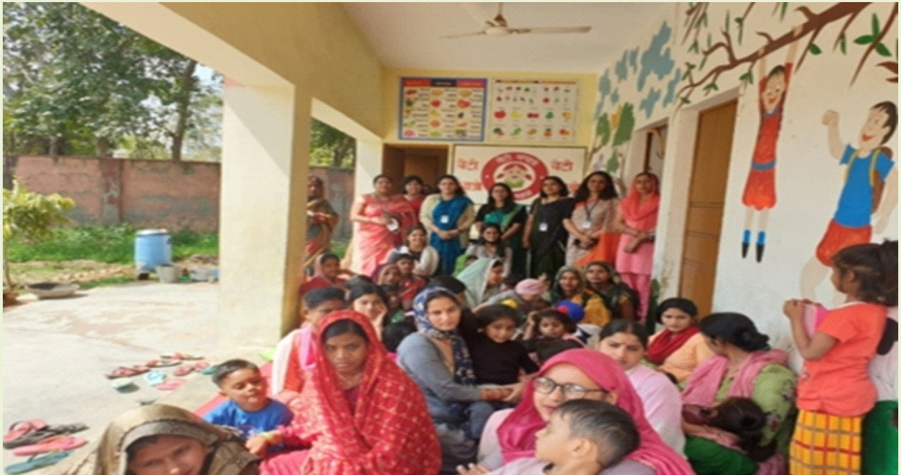
Faculties and students from ASAP Department with Anganwadi