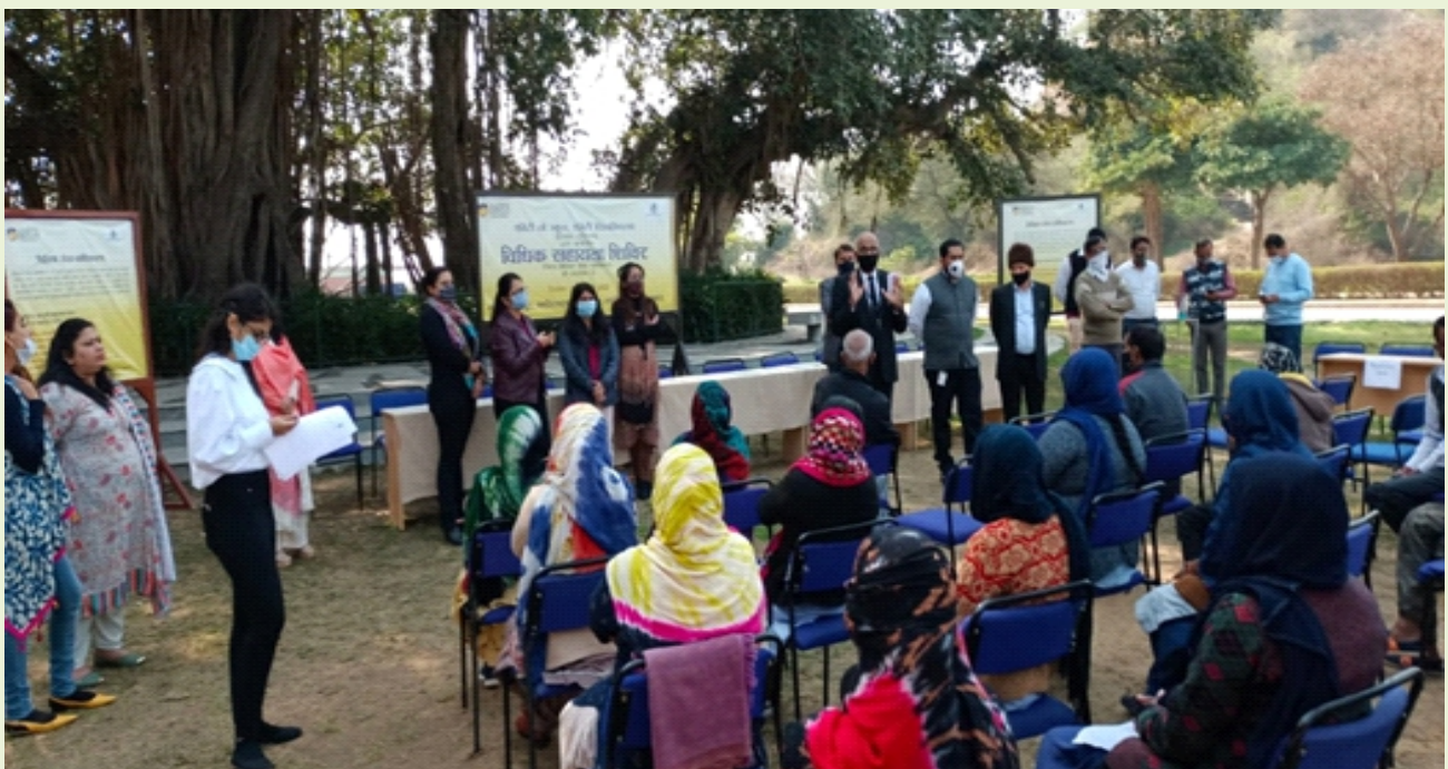
Villagers actively participating in the workshop