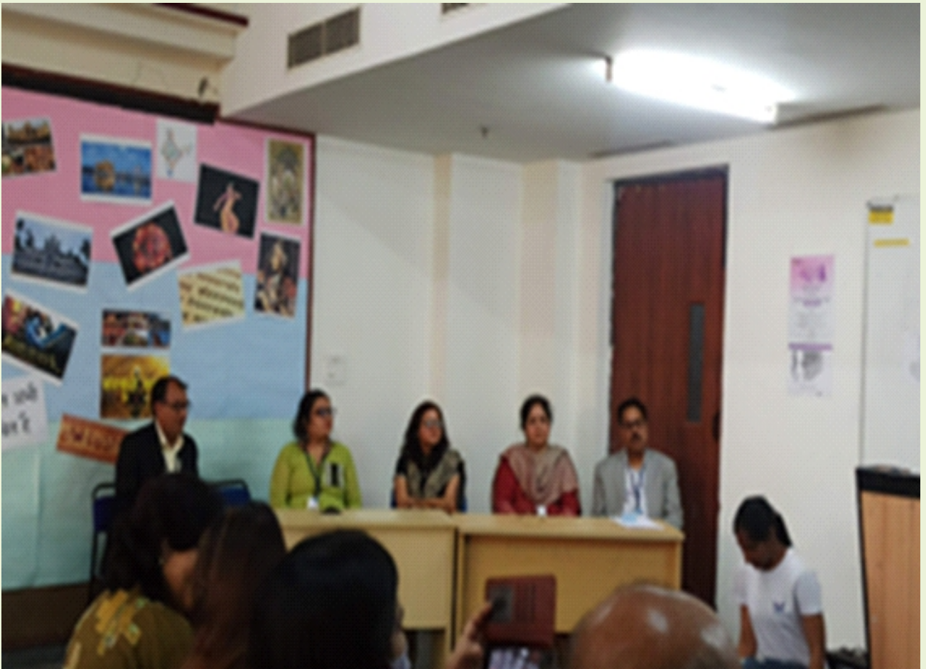
Esteemed Panellist admiring the student's performance