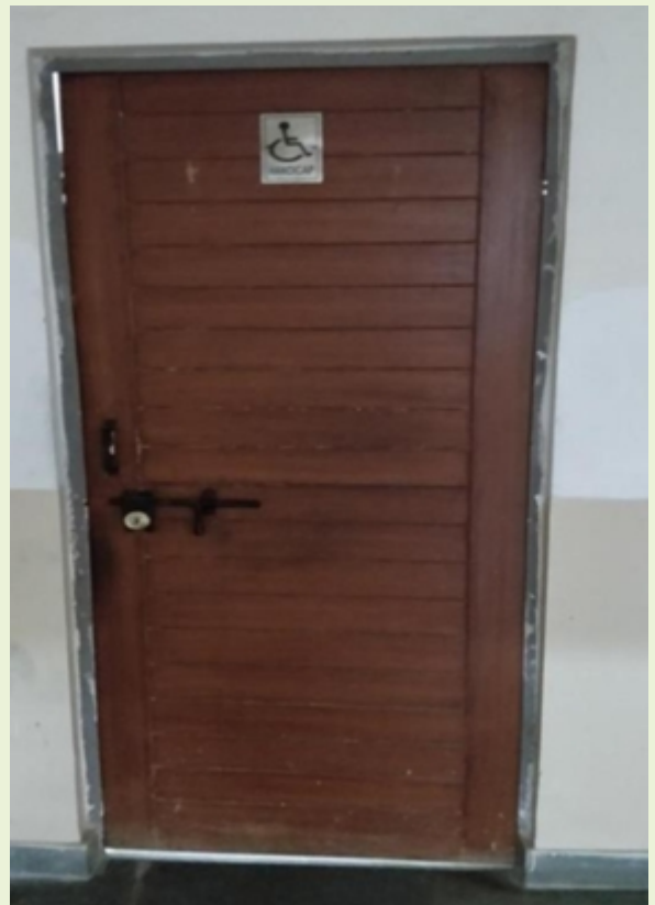
Fig: Divyang friendly toilets Fig: Provision of ramps and wheelchairs