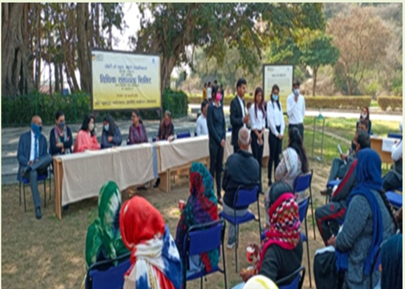
Students from Amity Law School creating awareness among villagers