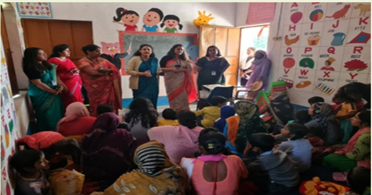
Faculties interacting with women and children in Anganwadi

The Society Outreach Programme "Women's Day Anganwadi Visit" was conducted on 08-Mar-2022 by Amity School of Architecture and Planning. Awarded women's of Panchgaon about Gender equality and women rights and how to create something useful out of waste material.