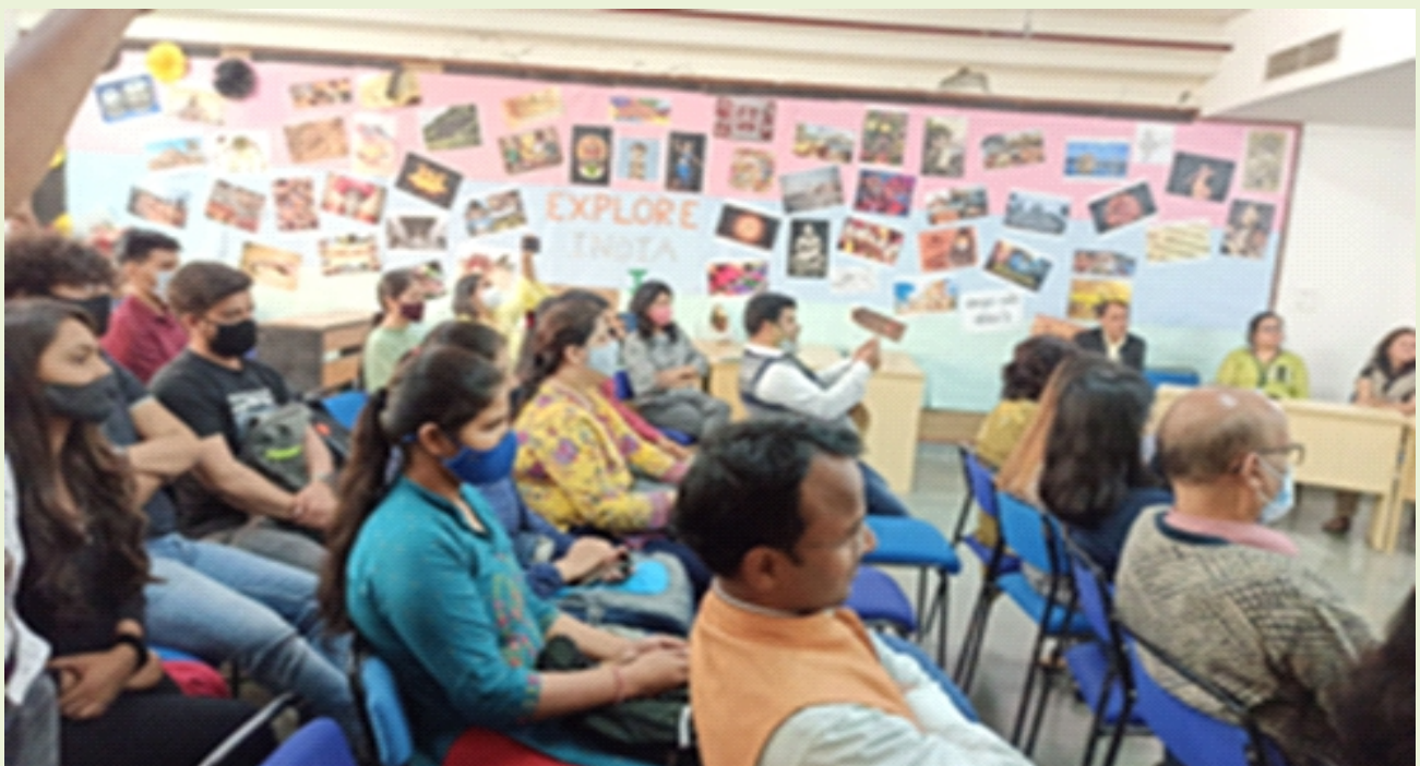
Audience actively listening and participating in the discussion.

The Panel Discussion on "Gender Equality today for a sustainable tomorrow" was conducted on 08-Mar-2022 by Amity School of Liberal Arts. Participated students learnt To mark and celebrate the social, economic, cultural and political achievements of women and raise awareness about women's equality and accelerate gender parity.