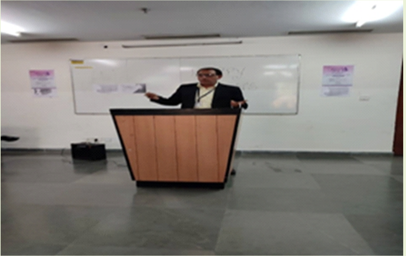
Panellist addressing the audience.